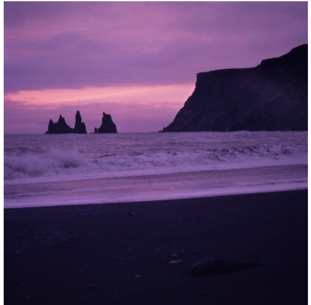
Sunset at Vik, southern Iceland